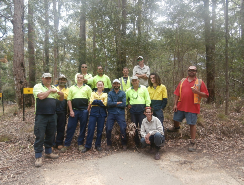
Group photo—The Grafton, Corindi, Ngurrala & Coffs Harbour Green Teams